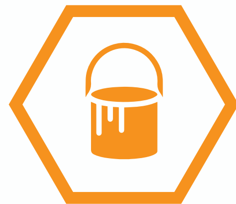
Paints & Specialty Coatings