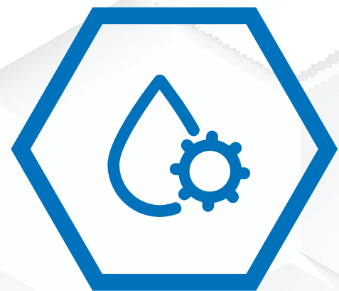
Oil and Gas

Aegex Technologies is proud to offer its 2nd Generation intrinsically safe tablet , the Aegex100M with faster wireless services, enhanced memory, and expanded storage. Operating in the most hazardous industries with explosive environments, Aegex solutions bring real-time connectivity to help organizations harness the power of data to optimize efficiency.